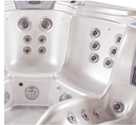
Focus massage seat