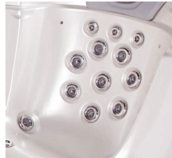
Intenso massage seat